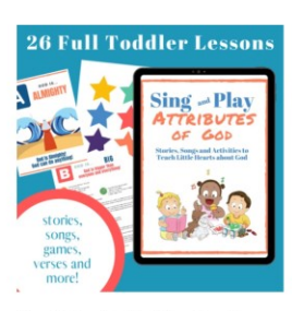
The Ultimate Toddler Bundle: Everything you need to teach age 1-3 about God