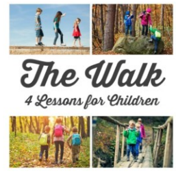
"The Walk" 4 Week Study on Following Jesus $29 $45