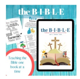
The BIBLE Unit 1: Genesis to Ezra (13 Week Curriculum) from $97 $125