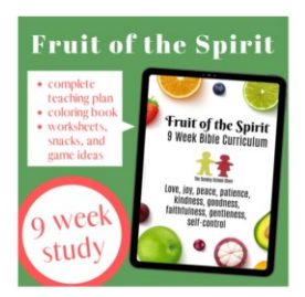
"The Fruit of the Spirit" 9 Unit Curriculum for Kids $57 $90