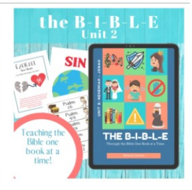
The BIBLE Unit 2: Nehemiah to Micah (13 Week Curriculum) from $97 $125