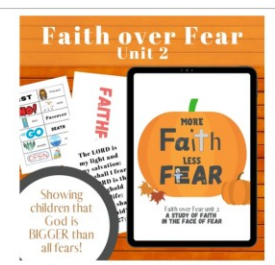
More FAITH Less FEAR: 4-Week Children's Ministry Curriculum (Unit 2 of Faith over Fear) $45