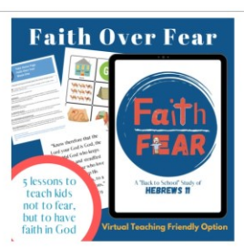
"Faith Over Fear" 5 Lesson Unit for Back-To-School from Hebrews 11 $55