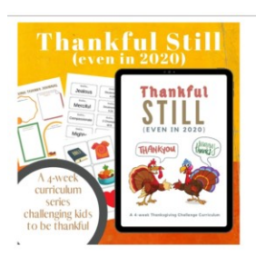
Thankful Still (even in 2020) 4-Week Sunday School Curriculum $45

If your church buys resources, please consider using <u>The Sunday School Store</u>. Church budgets are tight. That's why our digital curriculum is half the cost of printed material. Even when finances are limited, your teaching can make an eternal difference.